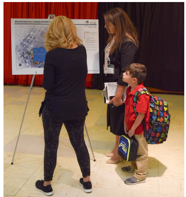
A parent reviews the proposed site plan for the MacArthur/Bonham consolidation as a project manager stands by to answer questions at a Bond open house event.

All consolidations will be in the fall of 2020 or 2021.