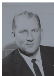
DONALD LEE HASKINS PK-8 LINCOLN/BOND/ROBERTS CONSOLIDATION

Donald "Don" Haskins — the famed Bear of the University of Texas at El Paso — is one of the most well-known names in basketball for his outstanding record on the court and his role in helping to end segregation in college sports. Haskins made history as the coach of Texas Western College by starting five African-American players in the 1966 NCAA Men's National Championship finals and defeating the highly-favored University of Kentucky. As of 2018, he remains the only Texas coach to lead his team to a men's national basketball championship.