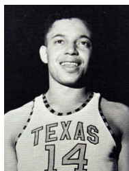
TYRONE "BOBBY JOE" HILL PK-8 TERRACE HILLS/ COLLINS CONSOLIDATION