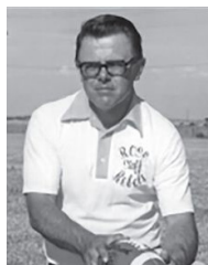
WALLY HARTLEY PK-8 ROSS/HUGHEY CONSOLIDATION