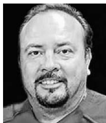
ARCADIO DURAN, JR. ELEMENTARY DOWELL/SCHUSTER/CROSBY CONSOLIDATION

She was inducted into the El Paso Women's Hall of Fame and was recently named as one of the 80 Most Influential Hispanics in the U.S. by U.S. Hispanic Business Magazine. She also has been honored as the 2005 Outstanding U.S. Bilingual Educator by the Education Ministry of Spain, the 2002 Texas Professor of the Year by the Carnegie Foundation, the recipient of the 2002 Multicultural Educator Award from the National Association for Multicultural Education, and the winner of the Texas Higher Education Star Award.